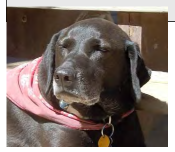
On-The-Dog-Beat _ Canine Columnist: Huckleberry