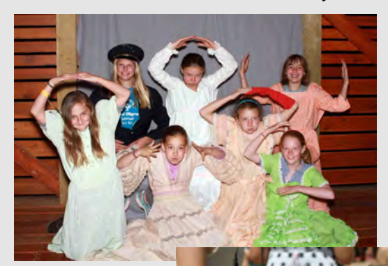
The "spirit of the Glen" evidenced by the friendships made and renewed each summer

Last summer was a quite unusual in the amount of rain we received! This made us even happier to be building a new and enlarged Marathon! This photo is dramatic showing what it looks like at GG following a downpour (which chased everyone in to their cabins and dorms), and a full blazing sun!